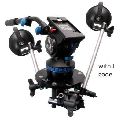
with Fluid Head T10 code no. 149417