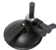
The MULTI MOUNT suction pad with highly flexible rubber coating for all smooth surfaces. 145993