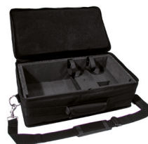
The MULTI MOUNT bag for convenient transportation. 100559