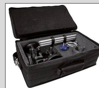
MULTI MOUNT | code no. 145990 in bag | code no. 100559

With the included Euro Adapter, the MULTI MOUNT is compatible to the versatile Panther accessory range.