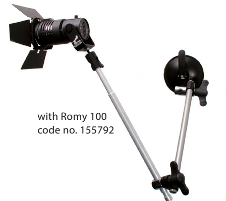
with Romy 100 code no. 155792