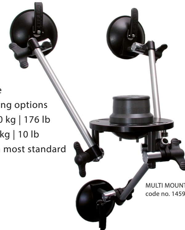
MULTI MOUNT code no. 145990