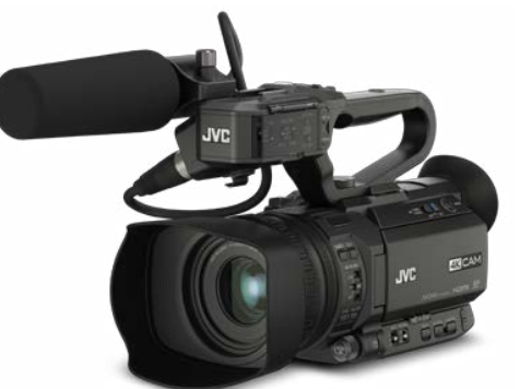
Camera shown with optional shotgun mic

Sports Production, Live Stream capable compact handheld camcorder with integrated 12x zoom lens