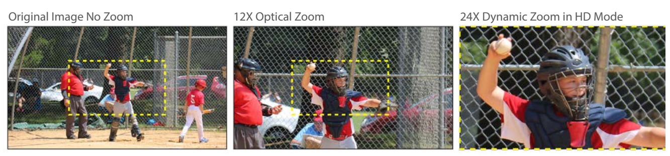
Dynamic Zoom combines Optical Zoom plus Pixel Mapping—focusing on a smaller image area for lossless 24X Zoom